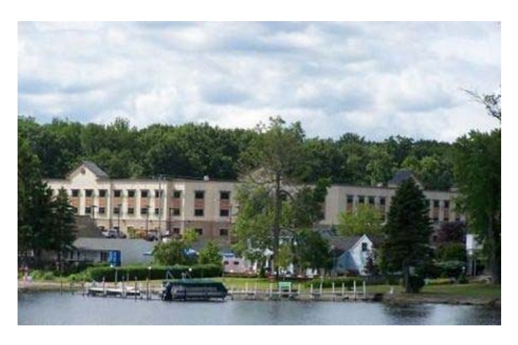
The Chautauqua Bon Vivant 2009

To spend an exciting weekend at the Suites, located at 215 West Lake Road, Mayville, New York, 2 miles from the gates of the esteemed Chautauqua Institution, contact their Reservations Department at 1-716-269-STAY and mention code "Vivant" for a special discounted rate.